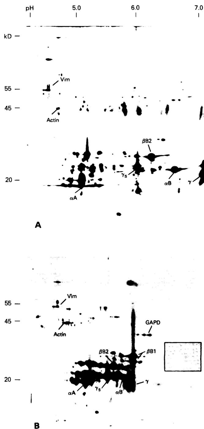
Figure 1 Two-dimensional electrophoresis gels of fetal human lens using (A) equilibrium and (B) non-equilibrium techniques. Inset in panel B shows the immunoreactivity on a Western blot after probing with an antibody against \beta B1-crystallin. The numbers indicate the position of the proteins sequenced.

Protein sequencing was done by Harvard Microchemistry Facility, Cambridge, MA. The proteins, after transfer to Immobilon P, were treated with cyanogen bromide to generate free amino terminal residues before sequencing.